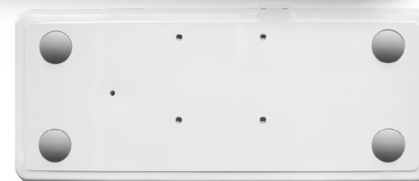
300XXX00 bottom: 6 rubber feet, 4 x 5mm, 2 x 15mm supplied for different angles + Brass inserts on 75 mm VESA distance