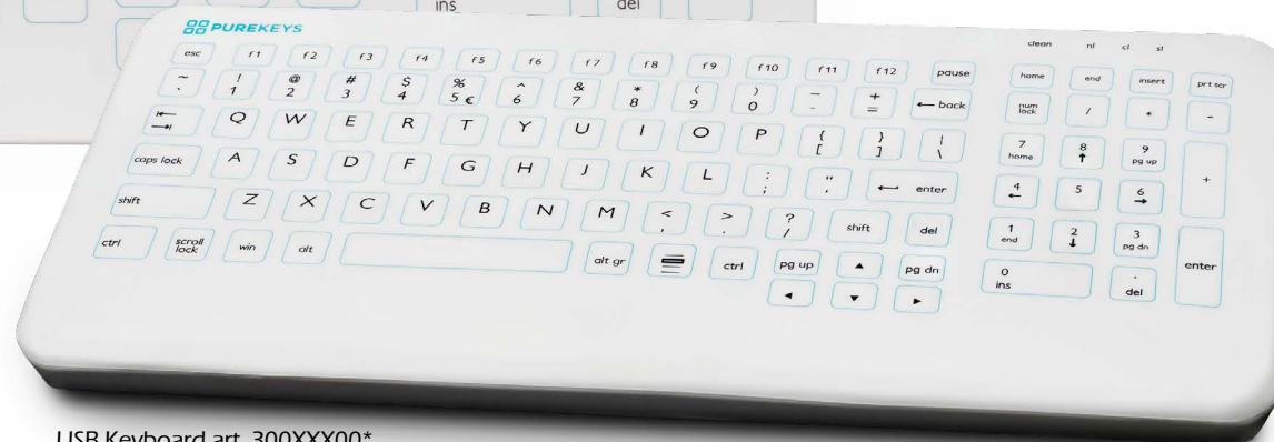
USB Keyboard art. 300XXX00*

Tlf 38 27 88 88 - www.dentalnet.no - post@dentalnet.no