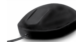
Disinfectable USB Mouse with touch scroll White art. 40065 Black art. 40265