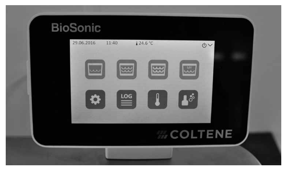
Figure 12 Main Screen