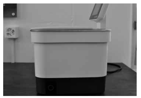
Figure 4 Drain valve and hose