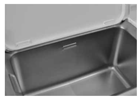
Figure 6 UC150 Tank Fill Lines