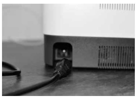
Figure 9 Power Cord