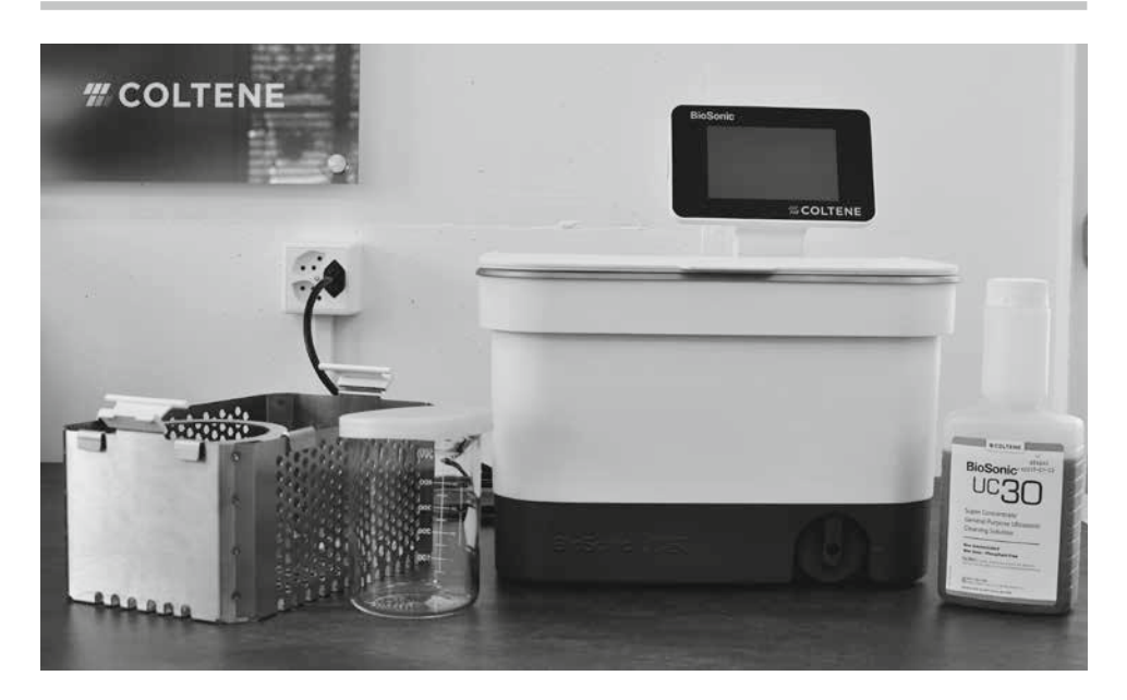
Figure 1 UC150 Parts and descriptions