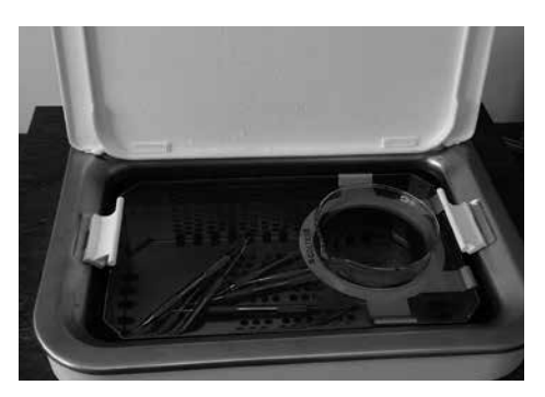
Figure 8 UC150 Basket with cassettes