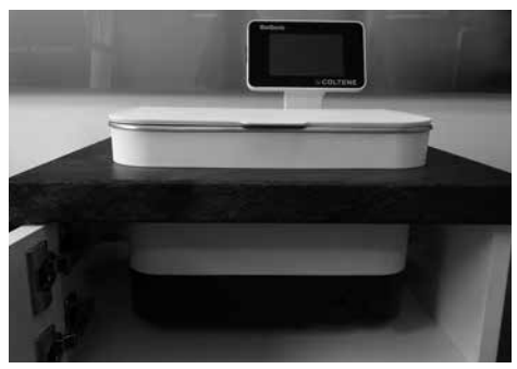
Figure 11 Recessed UC150 Unit