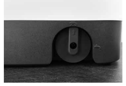
Figure 5 Drain Knob